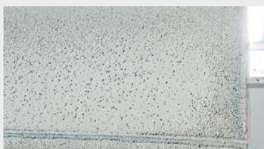
Poret® Wrap before pulse effect

In contrast, the Poret® Wrap also excels in the pulse effect as an optimal protective shield for pulse filters.