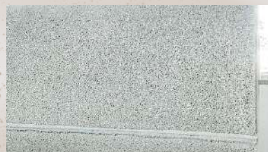
Poret® Wrap after pulse effect